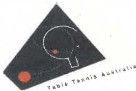
Table Tennis Australia Inc.