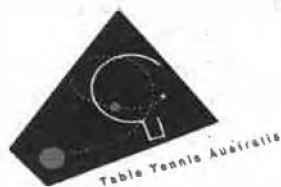
Table Tennis Australia