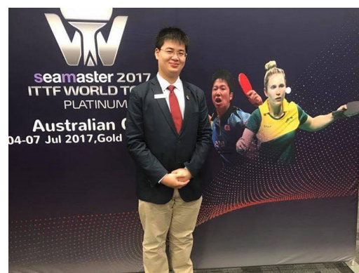
Table Tennis Australia