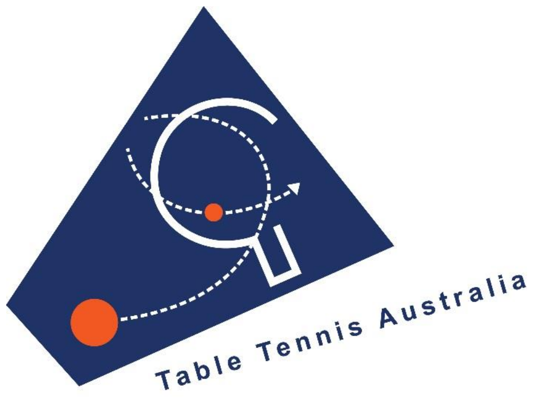
TABLE TENNIS AUSTRALIA LTD.