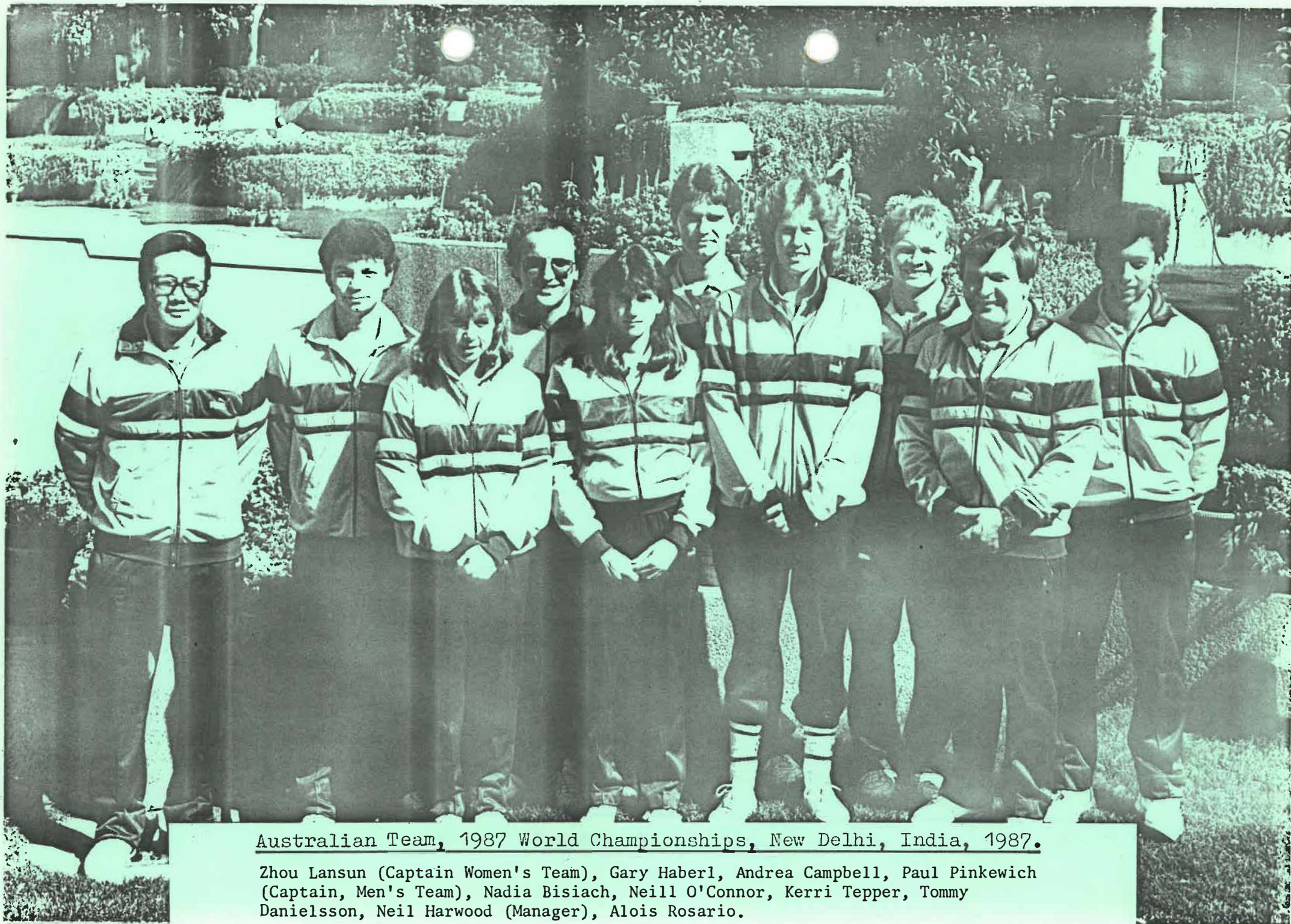
Australian Team, 1987 World Championships, New Delhi, India, 1987.