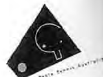
Table Tennis Australia