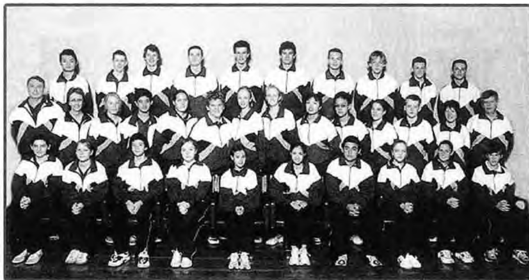
2006 Queensland Junior Team