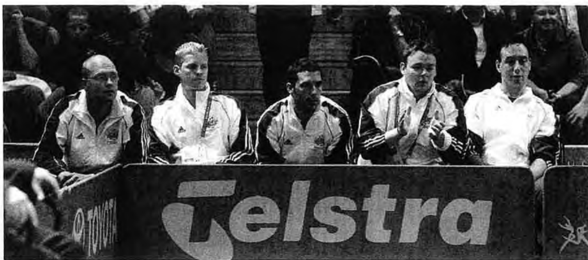
The Australian Men's Team at the 2006 Commonwealth Games