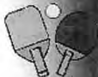
Table Tennis ACT State Report