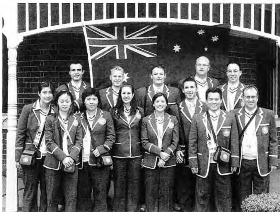
Australian Table Tennis Team at the 2006 Commonwealth Games