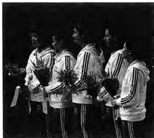
Women's team winning silver at the 2006 Commonwealth Games