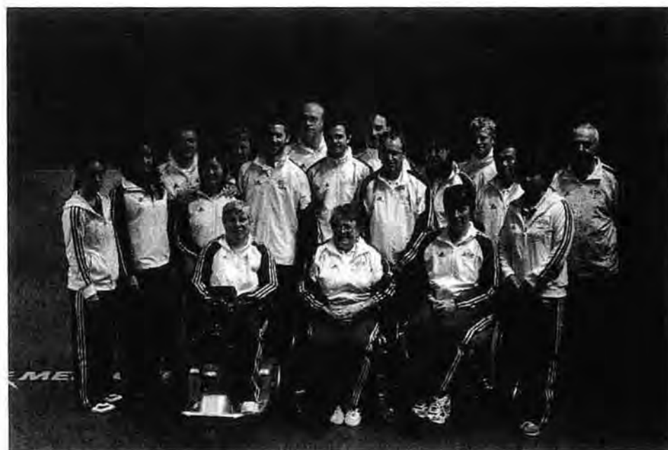
Australia team at the 2006 Commonwealth Games