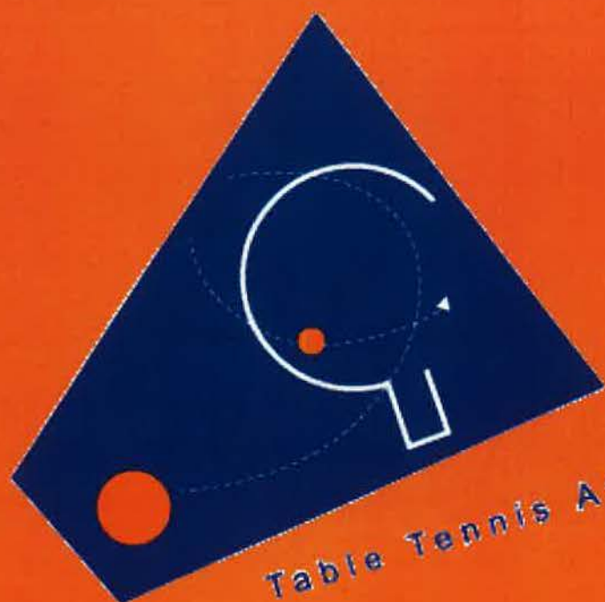
Table Tennis Australia