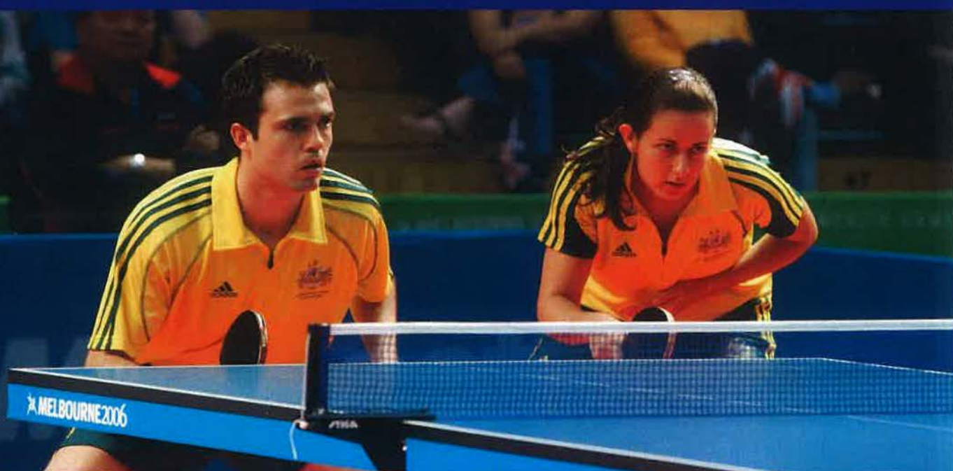
Table Tennis Australia 2006 Annual Report