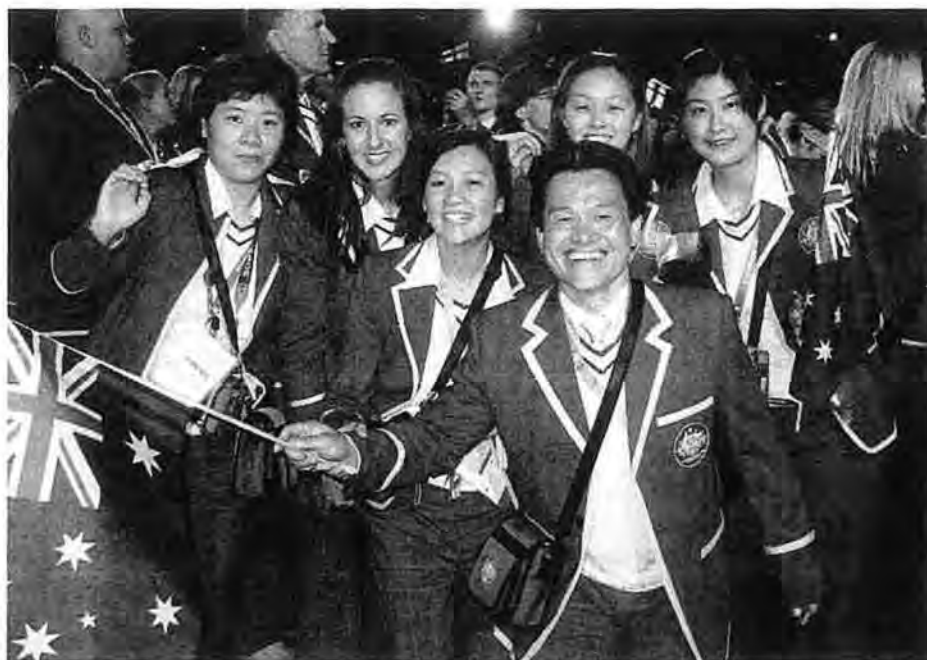
The Australian Table Tennis team at the Opening Ceremony at the 2006 Commonwealth Games