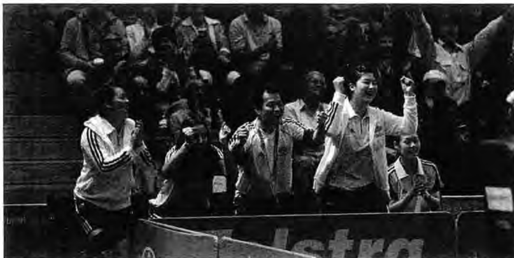
Australian Team at the 2006 Commonwealth Games in Melbourne

National High Performance Management Team - Team Leader