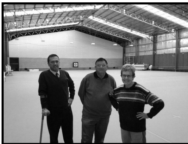
At the new Tuggeranong Archery Centre in Greenway – an additional venue for table tennis

After many years of hard work by many people, at long last we received the opportunity to expand to an additional venue at Greenway (in Tuggeranong region). TTACT began using the new venue, initially at two sessions per week, in the latter half of 2013.