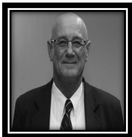
Table Tennis Australia is positioned well to take advantage of the opportunities which present themselves in 2014 and beyond. In saying that, the board has decided to conduct a review of the organisation in 2014 to maximise the return to the members. The guidelines include a review of the staffing structure and the cost effectiveness of programmes.

I have been personally involved in developing a relationship with the Asian community and particularly the Chinese table tennis community in China. I have been successful with a sponsorship deal worth $100,000.00 for tables and equipment for TTA and spent time in China getting to know many of the administrators running Chinese table tennis in the city's and provinces.