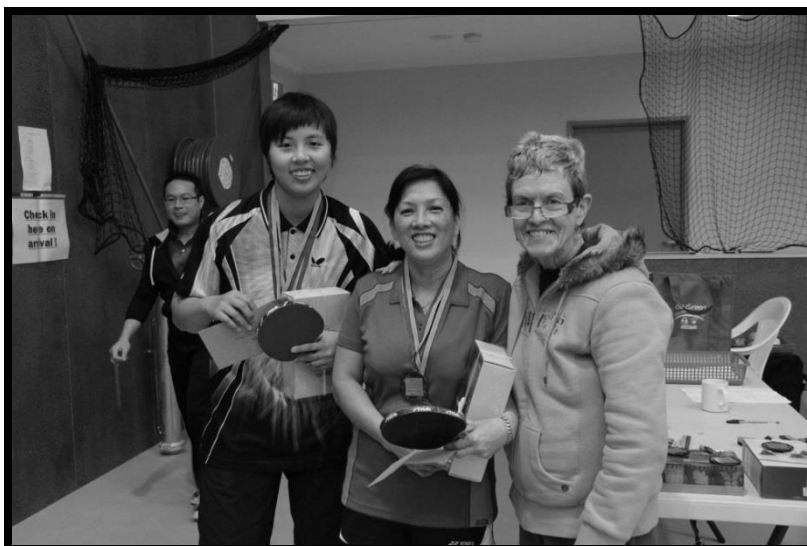
Some of the NSW winners at the successful A.C.T. Open