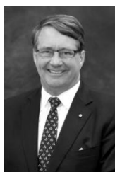
The Hon. Warwick Smith AM Chairman Board of the Australian Sports Commission

The ASC will continue to work with all NSOs, the state and territory institutes and academies of sport and state and territory departments of sport and recreation, reinvigorating access to, and participation in, sport across the community and driving Australia's continued sporting success.