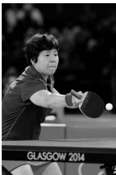
Victor Barna Award