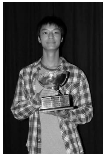
Michael Szabados Award