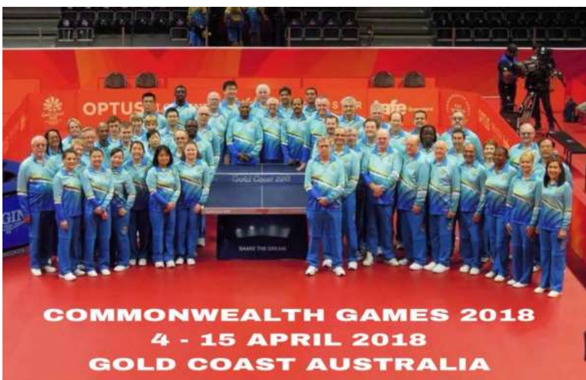
Umpires and Referees Team – 2018 Commonwealth Games, Gold Coast, Queensland