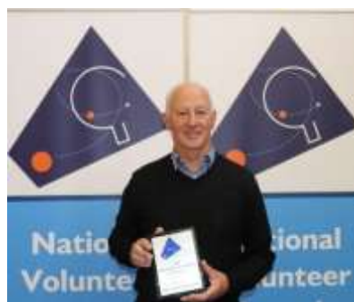
Club/Association of the Year Croydon & Districts Table Tennis Association