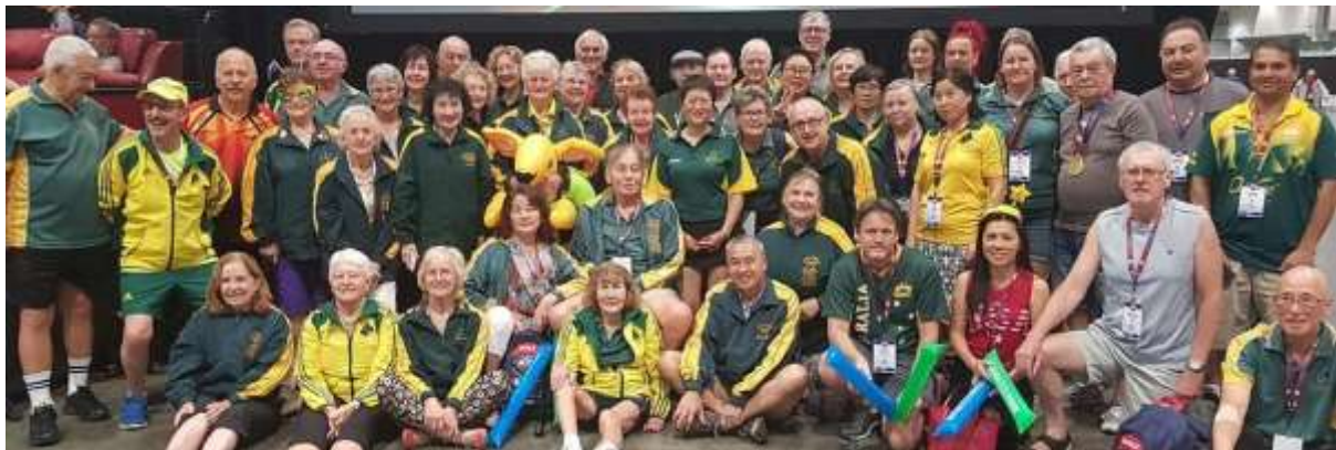
Australian contingent at the 2018 World Veterans Championships in Las Vegas, USA.

Chairperson – National Veterans Committee