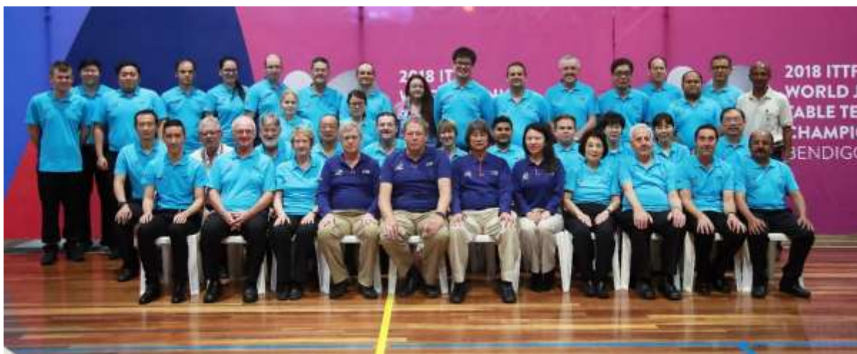
Umpires and Referees Team – 2018 World Junior Championships, Bendigo, Victoria