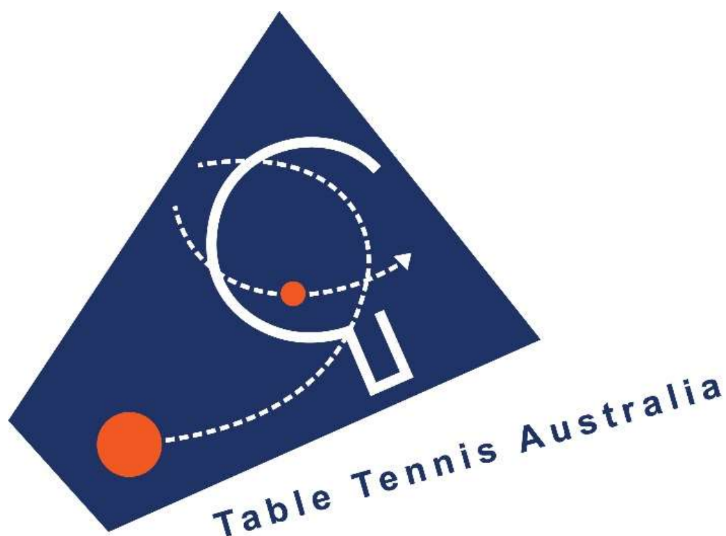
TABLE TENNIS AUSTRALIA LTD.